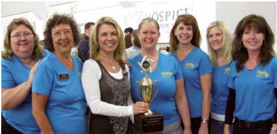
Grand Champs! Century 21 Beutler and Associates