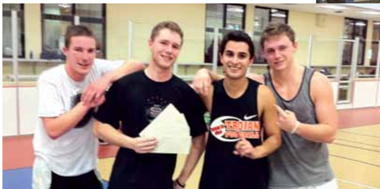
One Love SILVER WINNERS