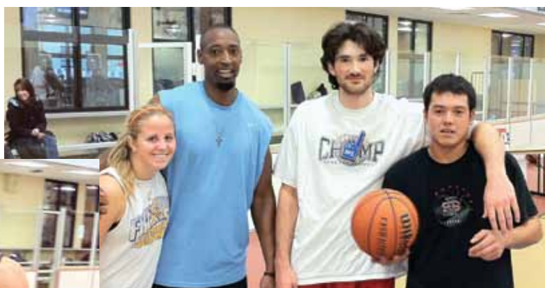
3 Duds and a Stud GOLD WINNERS